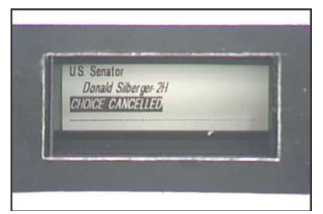
Display After Voter Cancels a Selection

The VVPAT window, located on the rear surface of the DRE, displays only a single ballot choice as each selection or deselection is made by the voter.