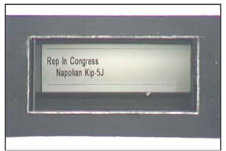
Display After Voter Makes a Selection

The VVPAT window, located on the rear surface of the DRE, displays only a single ballot choice as each selection or deselection is made by the voter.