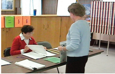
A voter walks in and registers at the check-in table.