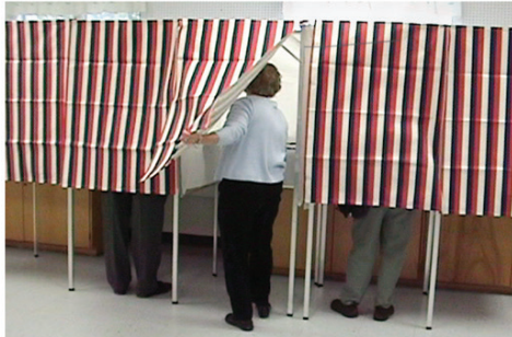
The voter enters an available marking booth to privately mark her ballot.

The voter heads for a private marking booth. A large poll site can have dozens of marking booths where many voters can mark their ballot at the same time.