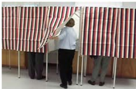
The voter enters an available marking booth to privately mark her ballot.

The voter heads for a private marking booth. A large poll site can have dozens of marking booths where many voters can mark their ballot at the same time.