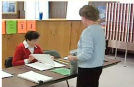
A voter walks in and registers at the check-in table.