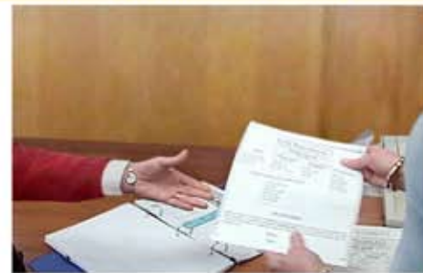
After signing in, the poll worker hands the voter a new, unmarked Paper Ballot.